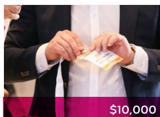
Obs-Gyne badges (production included) $10,000