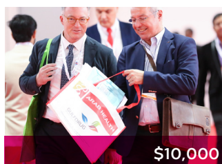
Obs-Gyne bags (production included) $10,000