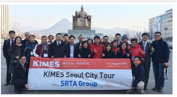
<KIMES Seoul City Tour>

Attractive tour programme presented memorable times to foreign visitors during KIMES show. KIMES offered Seoul City tour programme to experience famous sightseeing places and Korea culture.